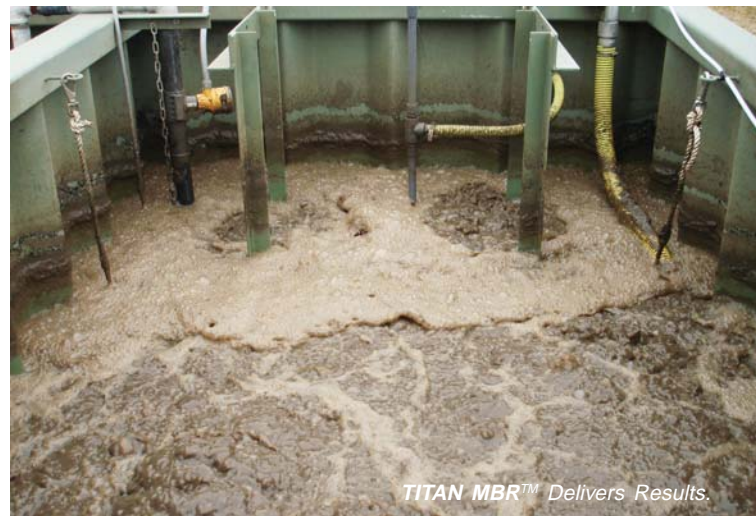
TITAN MBR™ Delivers Results.