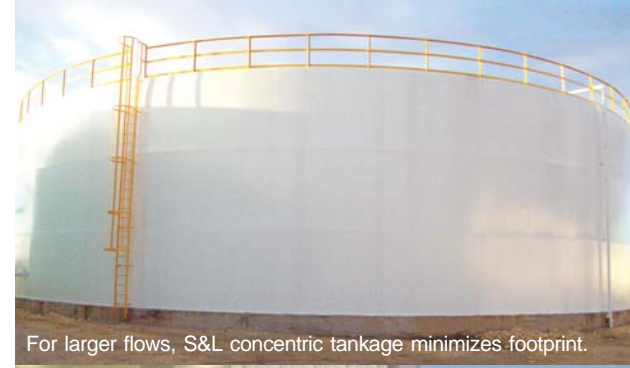
For larger flows, S&L concentric tankage minimizes footprint.