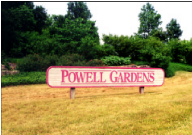
attracting hundreds of thousands of annual visitors