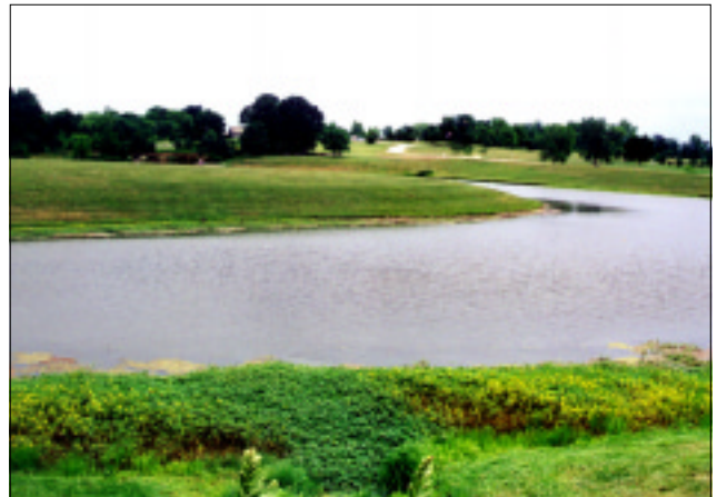
natural beauty is key for this 835-acre setting