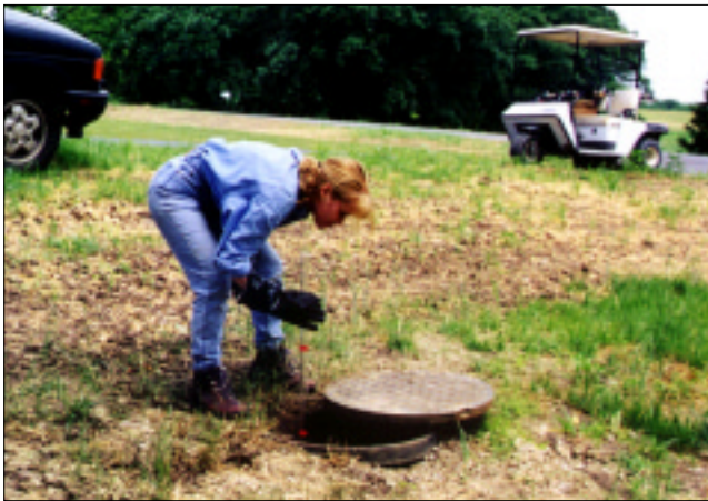
testing the Modular FAST system