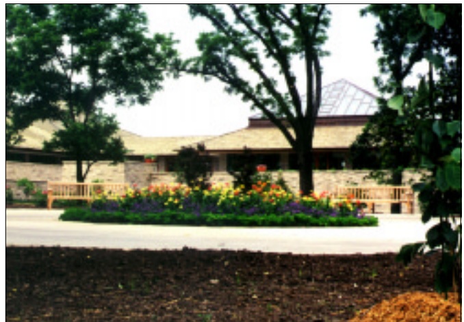
Smith & Loveless provided the Modular FAST wastewater treatment system (top, mostly unseen) to a botanical gardens to help the facility preserve its precious natural and aesthetic landscape while, at the same time, meet the growing wastewater treatment demands from its visitor center (bottom).