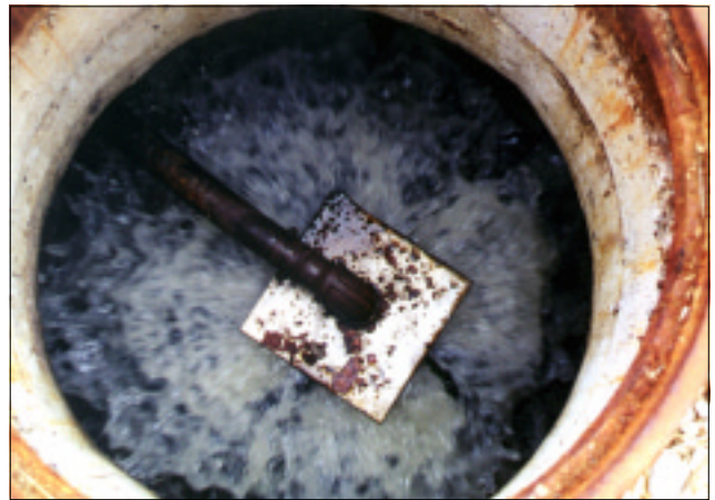
the underground Modular FAST during operation (aeration)