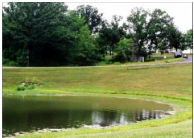
crystal clear effluent is released