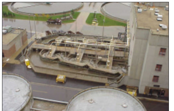
Milwaukee, Wisconsin - 420 MGD Peak Capacity

E-mail: answers@smithandloveless.com • Phone: (913) 888-5201 • FAX: (913) 888-2173