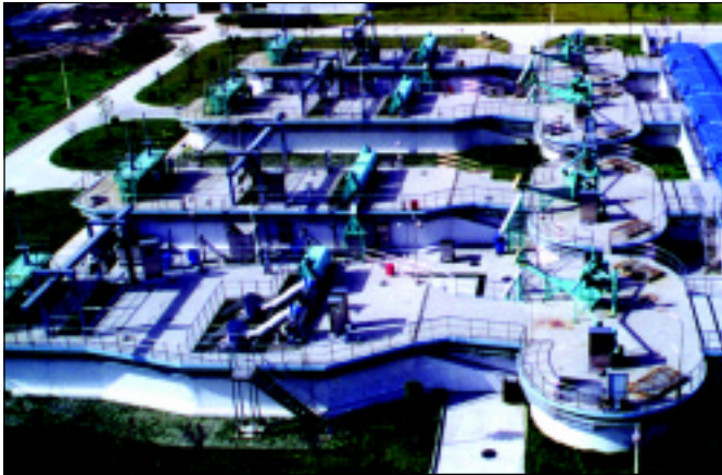
Shanghai, China - 560 MGD Peak Capacity