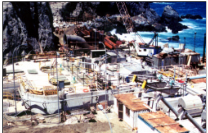
Valparaiso, Chile - 140 MGD Peak Capacity