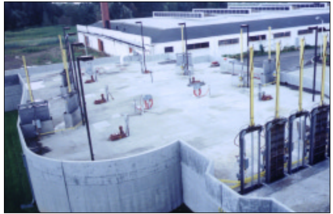
Portland, Oregon - 420 MGD Peak Capacity