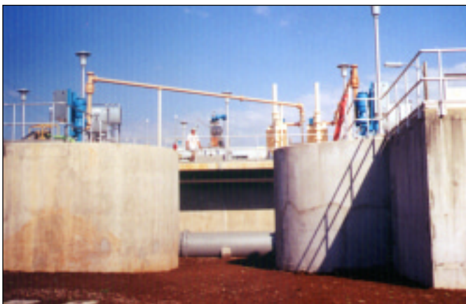
Franklin, Tennessee - 100 MGD Peak Capacity