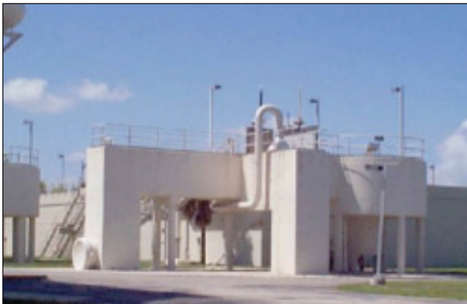
Broward County, Florida - 150 MGD Peak Capacity